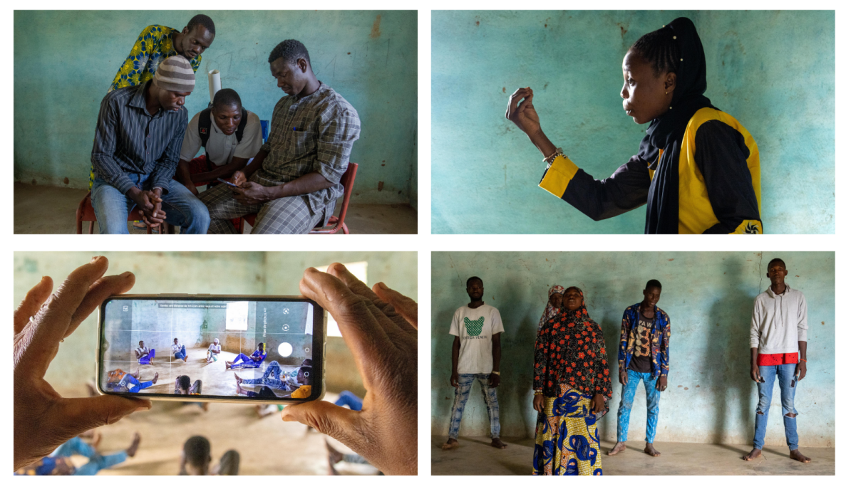
Picture: Impressions of the mobile school in the community of Madina Kourlamini, watch the video report <u>here</u>.