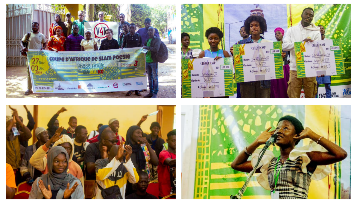
Picture from left to right: Artists together with V4TA members in front of the office in Bamako, the CASP winners, the audience, and a contestant.

Senegal was this year's champion, followed by Nigeria and Guinea Conakry.