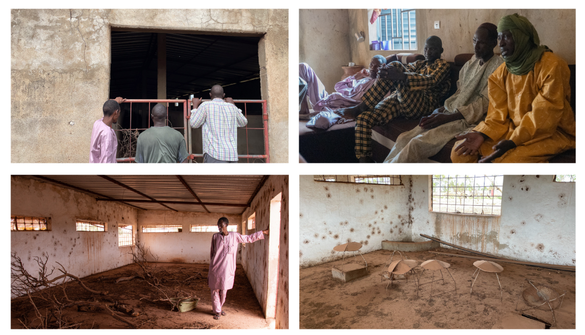
Picture: Photos of a group interview with the herdsmen and their living environment, Bamako, May 2023.