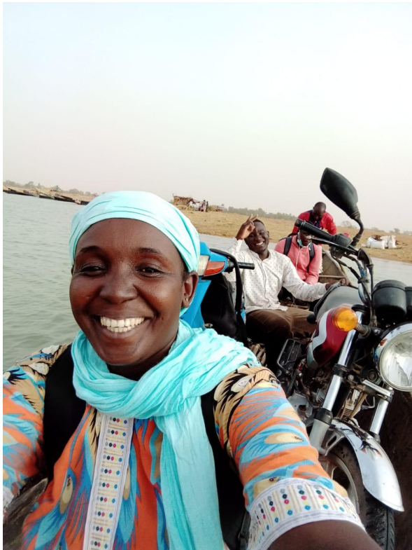
Picture: Team on their way to do research in the Macina region.

The young people from Kayes and Macina are either already trained by and working for the Voice4Thought Academy in the regions Segou and Macina, or are trained by V4TAcademy experts in qualitative research methods, archiving and the V4TA expert in artistic expressions. The first workshop will be held in February 2021 in Bamako. The mobile game will be launched in October 2022.