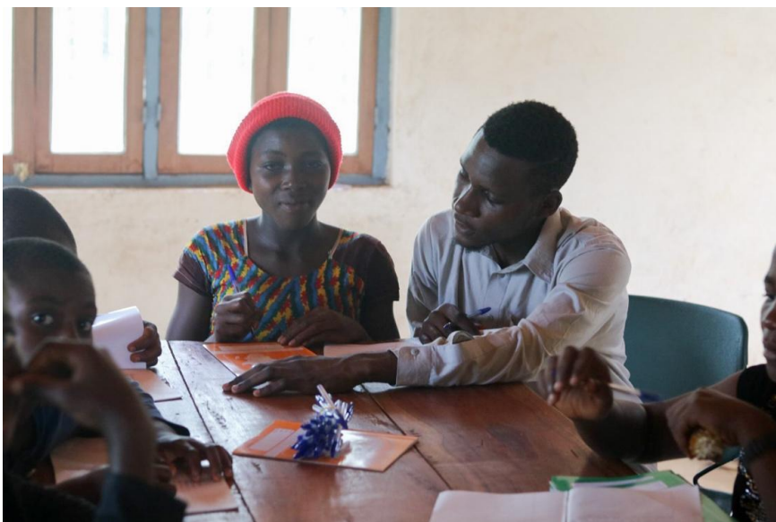
Baba, northwest Cameroon, 2016. Read his blog 'My stay at the orphanage' here.