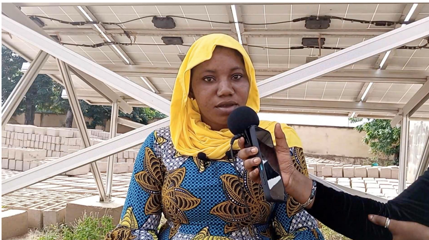
Read the ‘Ou est ma place dans cette société ?’ (What is my place in society?), here.