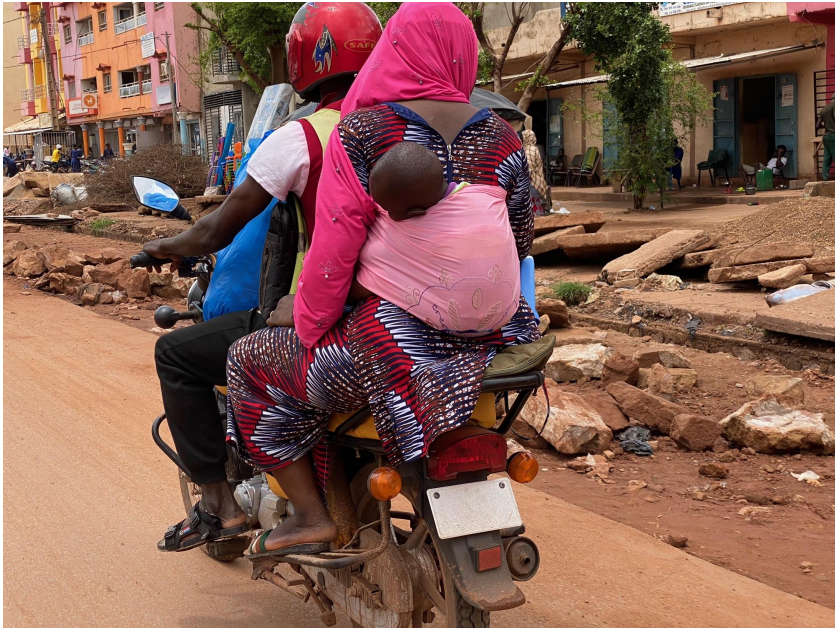
Picture: A mototaxi in Bamako. Read the blog series about motor taxis in Bamako, here .

Research themes included motor taxis in Bamako, conceptualisation of ‘youth’ by different actors, school activities in winter in San, goldmining, and unemployment of the youth.